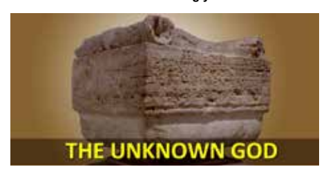
THE COMPLACENCY - V23 You worship a god that you don't know, and this is the God I am telling you about!

As I was going through your city, I saw the objects you worship. I found an altar that had these words written on it: to a god who is not known.