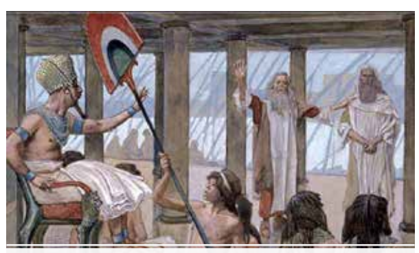
A POTENTIAL FOR FRICTION - V12-13