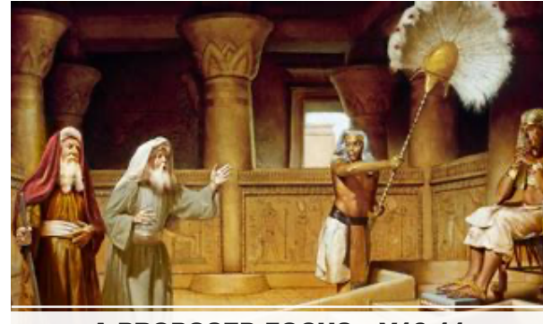
A PROPOSED FOCUS - V10-11