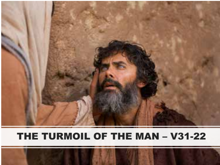
THE TURMOIL OF THE MAN - V31-22