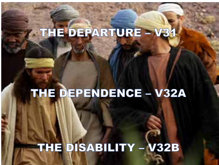
THE DEPARTURE - V31