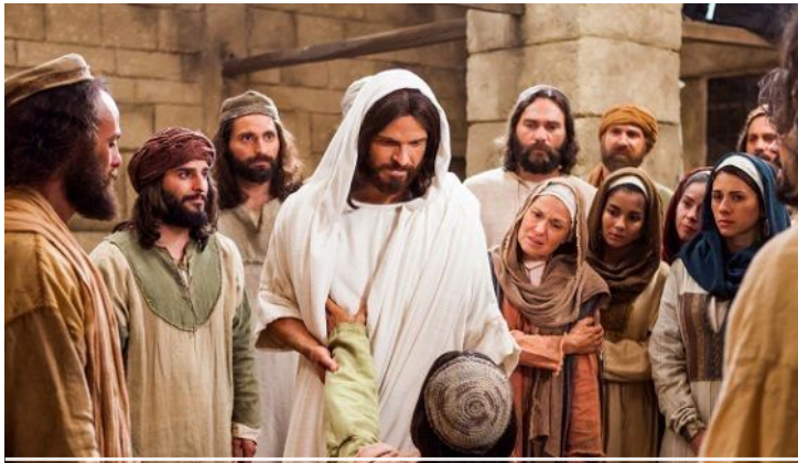
THE TESTIMONY OF THE MULTITUDE - V36-37