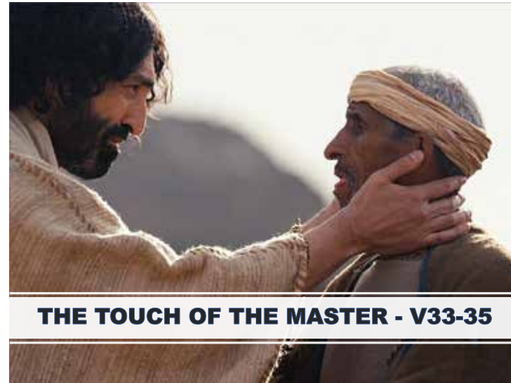
THE TOUCH OF THE MASTER - V33-35