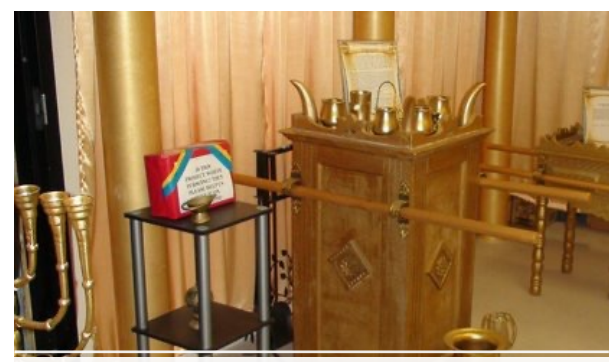
THE STRUCTURAL DIMENSION - V2-5